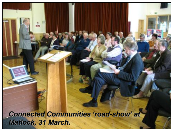
Connected Communities 'road-show' at Matlock, 31 March.

An important development since the last Newsletter has been the Trust's involvement with a new initiative sponsored by the Arts and Humanities Research Council aimed at enabling university history and archaeology departments to build closer links with local history and heritage groups.