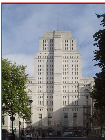
The University of London's Senate House, which houses the Institute of Historical Research.